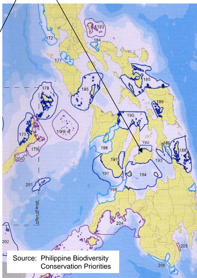
Source: Philippine Biodiversity Conservation Priorities